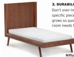
Nifty Junior Bed Kit, A$259.95, ubabub.com

Don't over-invest in age-specific pieces. Your child grows so quickly and so the room needs to evolve too.