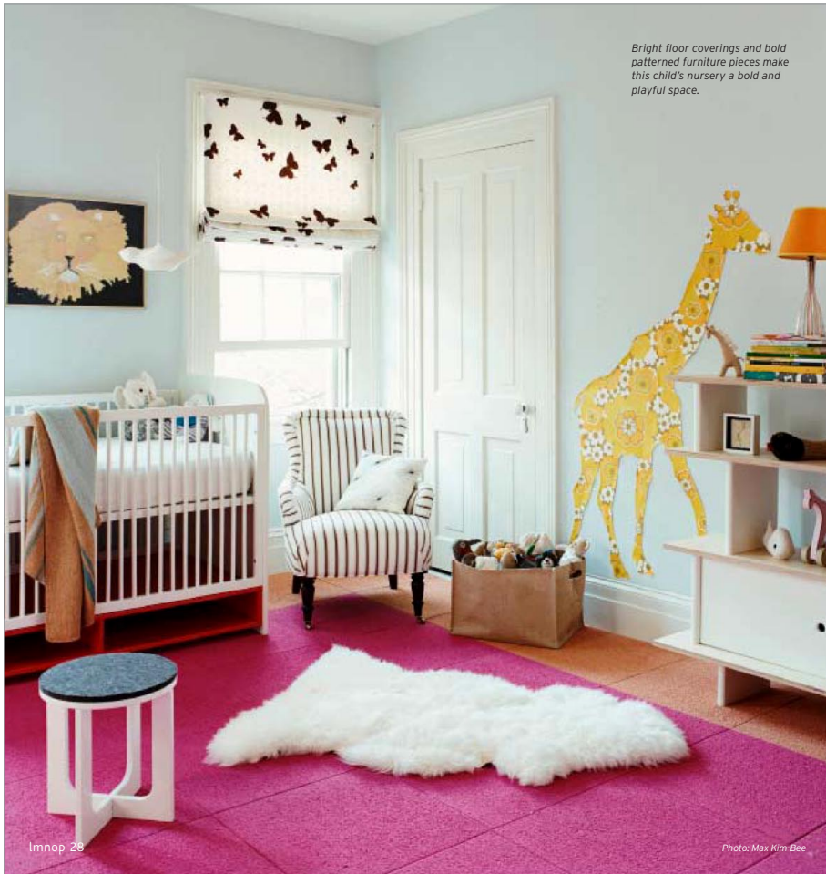
Bright floor coverings and bold patterned furniture pieces make this child's nursery a bold and playful space.